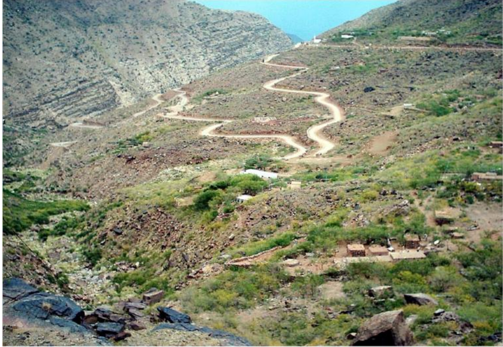
An aerial view of DG Khan